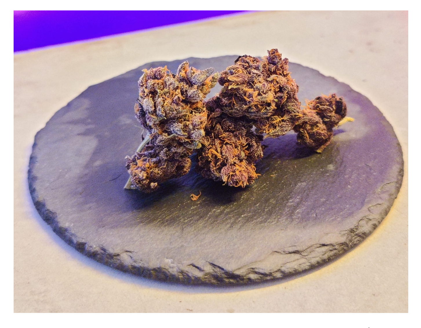
Weed Store Phuket – Patong Welcome to Phuket Cannabis Shop in Patong, Nanai Road 90/2! We offer a large selection of high-grade Indoor and Outdoor