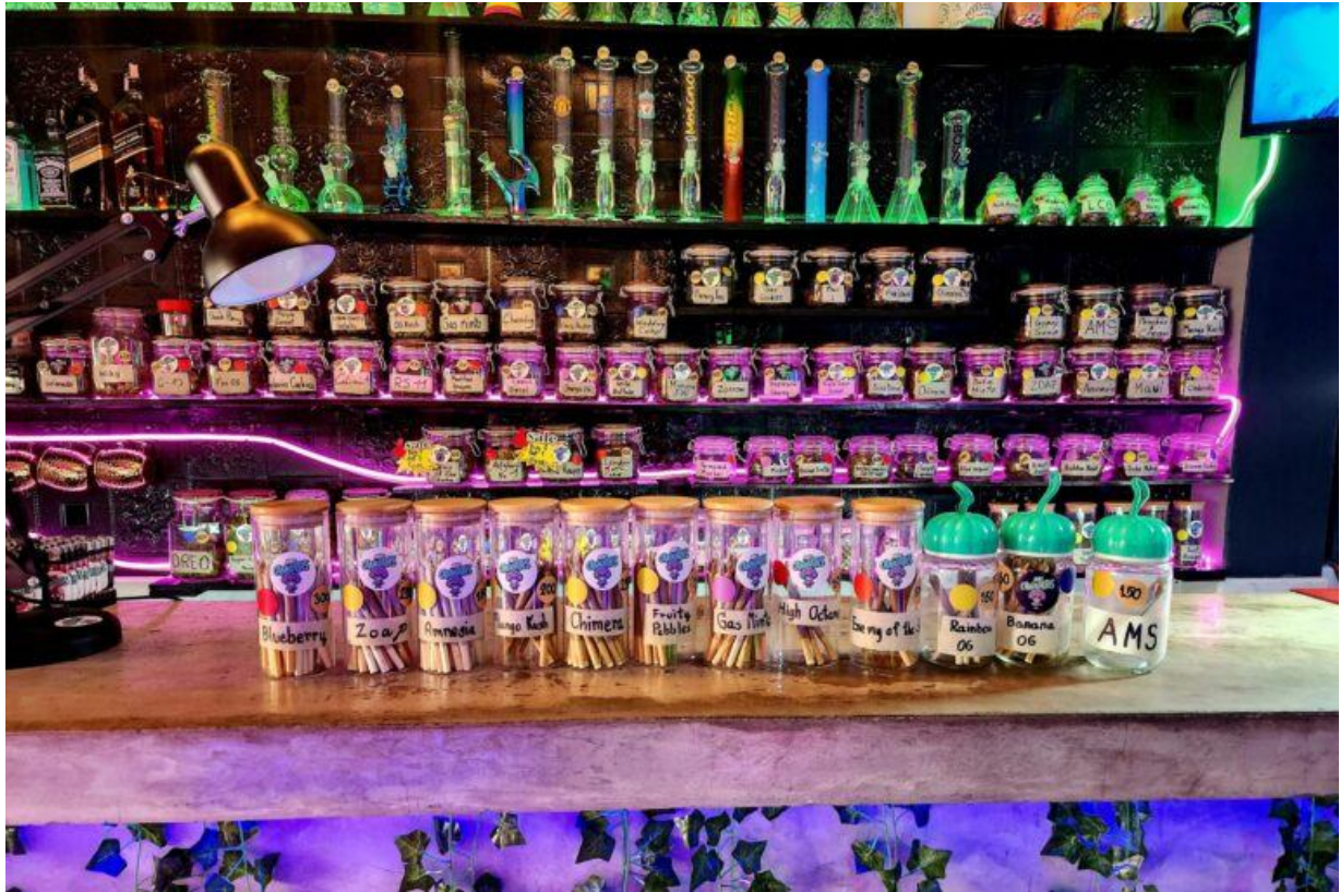
Handmade cannabis prerolls and blunts