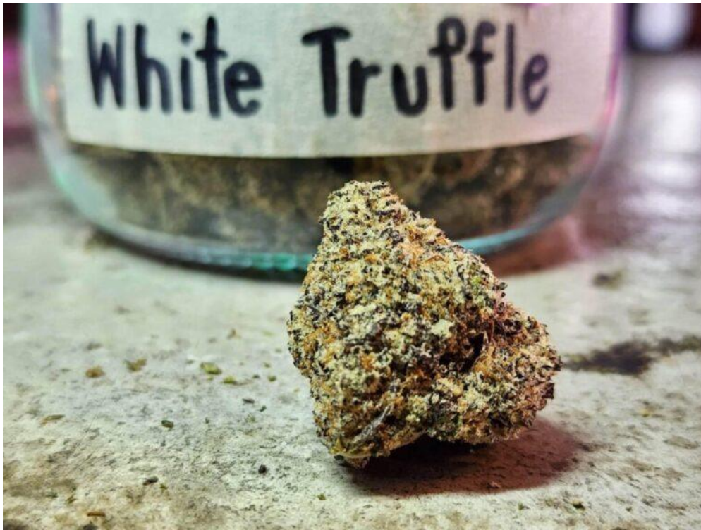
( https://www.patong-cannabis.com/buy-weed-in-patong/ )

Phuket Cannabis Shop ( https://www.patong-cannabis.com/sitemap/ )