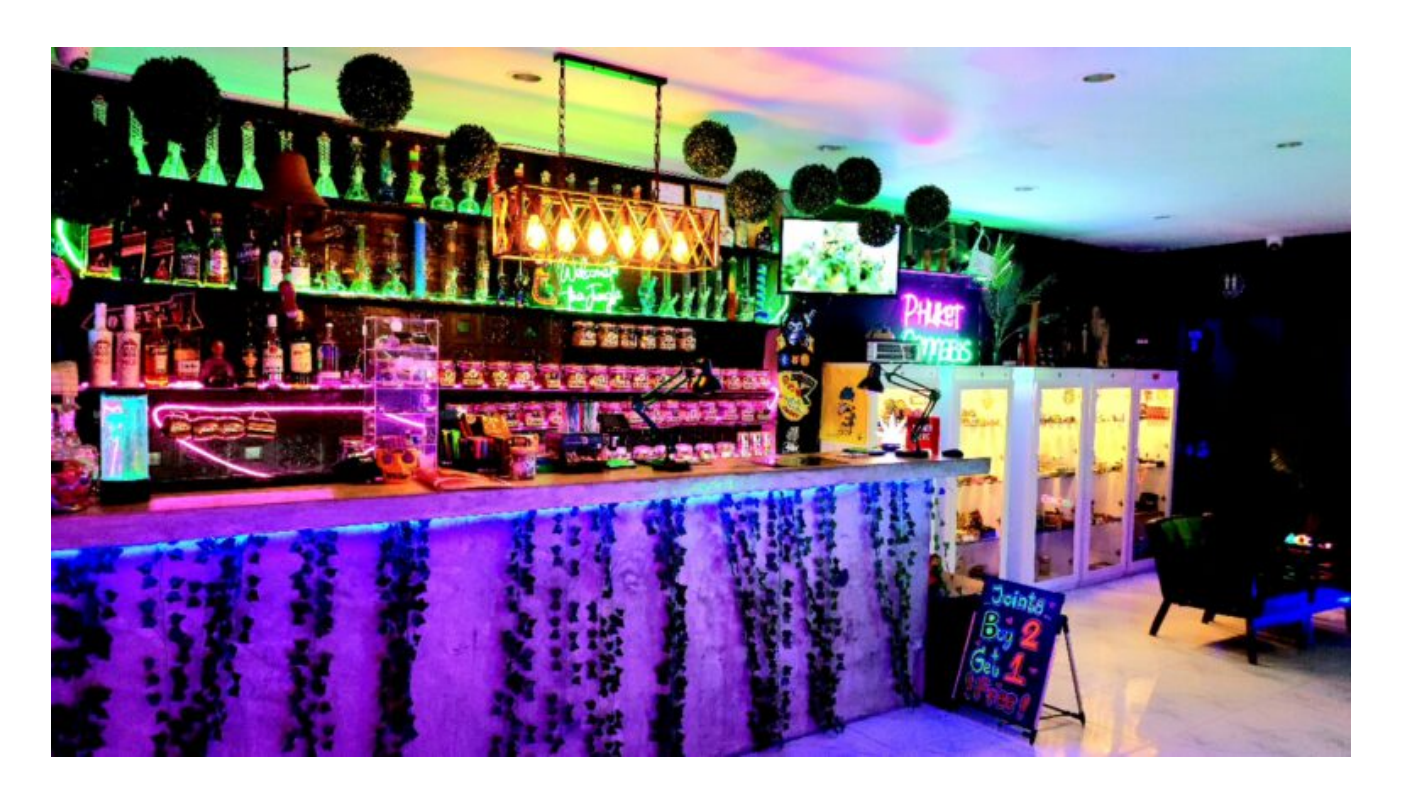
Phuket Weed Bar: Where the Magic Unfolds